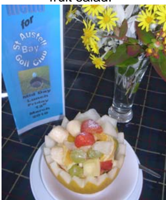
Kaye Pedley's finished fruit salad.